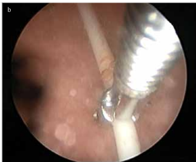
Figure 3. a, b. (a) Fragmentation of the stoned IUD by endoscopic laser lithotripsy. (b) Removal of the migrated IUD by forceps.