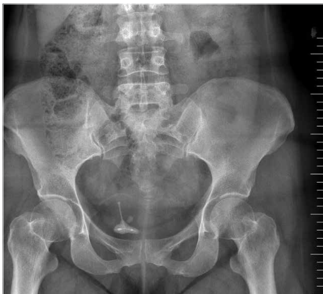
Figure 1. Encrusted intrauterine contraceptive device in the pelvic area. Plain abdominal radiography image.

The migration of an IUD is a rare complication. In such cases, the IUD can be extirpated by laparotomy, laparoscopy, or endoscopy. Cystoscopy and laser lithotripsy are effective, reliable, and minimal invasive treatments for migrated IUDs.