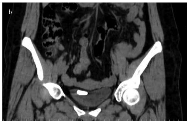
Figure 2. a, b. Image of the intrauterine contraceptive device that migrated to the bladder and the stoned device on performing computer tomography (a: axial section). Image of the intrauterine contraceptive device that migrated to bladder and the device on performing computer tomography (b: coronal section).