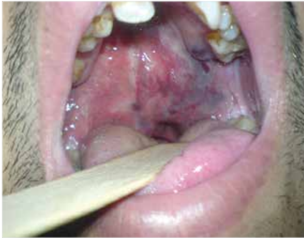
Figure 1. Intraoral view of the lesion in the left palatal region