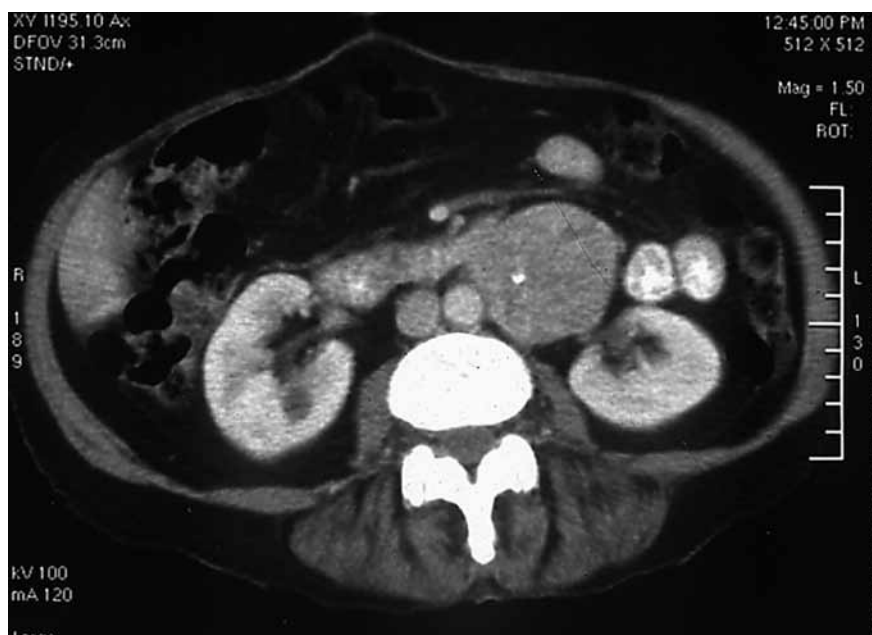
Fig. 2. Abdomen CT imaging after surgery.

After operation she followed up in Radiation Oncology Clinic. Physical examination was normal, CT scan of abdomen after operation was normal. Urine nor-metanephrine was 1.0 mg/24 hrs (normal: 0.0-1.2 mg/24 hrs), VMA: 5.4 mg/24 hrs. 24 months later she had severe hypertension attack, and when she arrived emergency clinic, she died because of myocardial infarction.