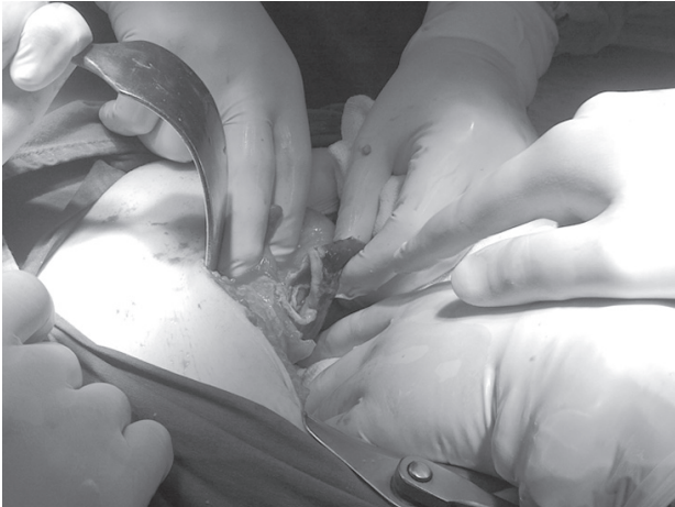
Fig. 2. A scene during the operation.