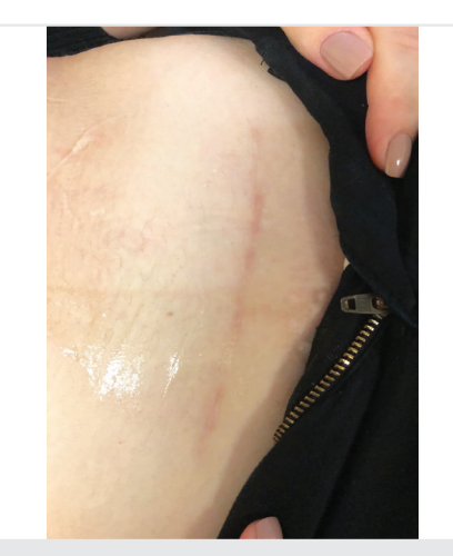
Figure 2. Appearance of skin incision at the 45<sup>th</sup> day

The stages of wound healing proceed in an organized way and follow four processes: hemostasis, inflammation, proliferation and maturation., Angiogenesis, fibroplasia and re-epithelialization occur in the proliferation phase (11,12). The proliferation phase in a wound healing process is completed in the first two weeks (13). The maturation phase, also referred as the remodeling phase of wound healing, is