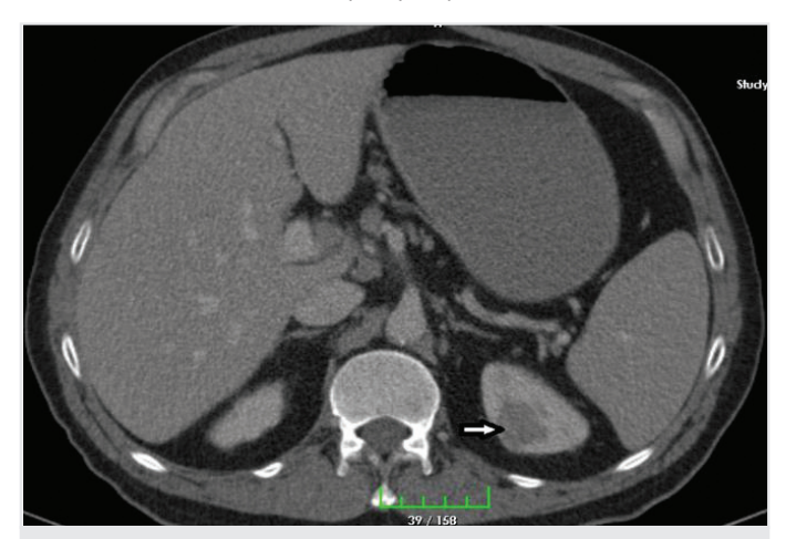
Figure 1. Focal hypodense area of hypodense localized in the upper pole of the left kidney (White arrow)

Renal insufficiency is common in patients with CLL, with a prevalence of 7.5% at the time of diagnosis and 16.2% over the course of the disease (7). The mechanism of renal insufficiency in these patients is variable. CLL infiltration can cause compression on renal tubules and microvasculature, resulting in renal obstruction and ischemia. Other potential causes of renal insufficiency in patients with CLL include contrast-induced nephropathy, treatment-induced tumor