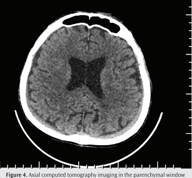
Figure 4. Axial computed tomography imaging in the parenchymal window 1 month after the second surgery. It is observed that the subdural collection and air densities regressed

was filled with saline solution, followed by the insertion of a catheter. During follow-up, both pneumocephalus and hemorrhage had resolved on cranial CT scan, and no neurological deficits were observed.