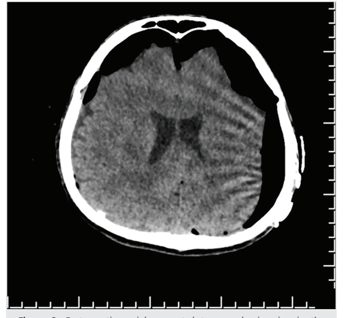
Figure 2. Postoperative axial computed tomography imaging in the parenchymal window after the burr hole technique for the evacuation of subdural hematoma. Widespread air densities consistent with pneumocephalus were observed in the subdural space. The Mount Fuji sign is in the left frontal region

was drained. The state of confusion improved during the postoperative period, and the hematoma showed regression in the follow-up cranial CT scan. The catheter was removed on the third day. However, on the fourth day, the patient developed headache and confusion, prompting a repeat cranial CT scan. Cranial CT revealed subdural pneumocephalus and a 3 mm midline shift in the same location. Upon making the skin incision, pressurized air was observed emanating from the subdural space. It was considered that air might have been drawn through the hole in the skin after the catheter was withdrawn. The subdural space