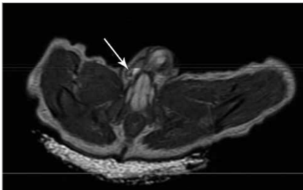
Figure 2. Axial MR image. The right testicle in the normal localization, the right testicular vessels, and the ductus structures are monitored in the right inguinal canal.