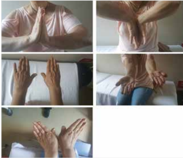
Figure 4. Clinical appearance of a 60-year-old female patient in the 6th postoperative month

In radiological evaluations, radial inclination and length, sagittal tilt, and radio-ular variance were evaluated based on the anteroposterior and lateral radiographs taken on the operated side. Mean radial inclination was found to be 16.2°, radial length 11.6 mm, sagittal tilt 6.1°, and radio-ular variance 0.7 mm. The Stewart radiological evaluation score was found to be 0.9 (11). According to the Stewart radiological evaluation score, excellent results were obtained in 4 (25%) patients and good results in 12 (75%).