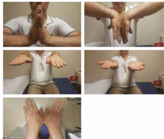
Figure 3. Clinical appearance of a 49-year-old male patient in the 6 th postoperative month