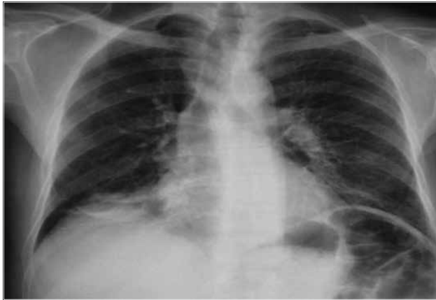
Figure 1. In PA chest radiography, a band of gray shade adjacent to the diaphragm in the base of the right lung