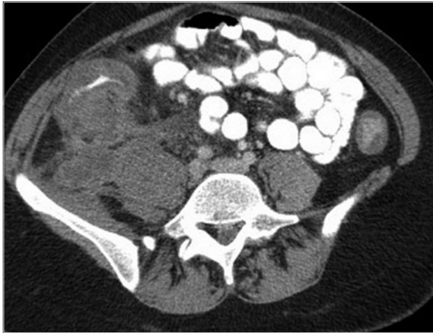
Figure 1. Inflammatory mass and abscess formation around the cecum on computed tomography (CT)