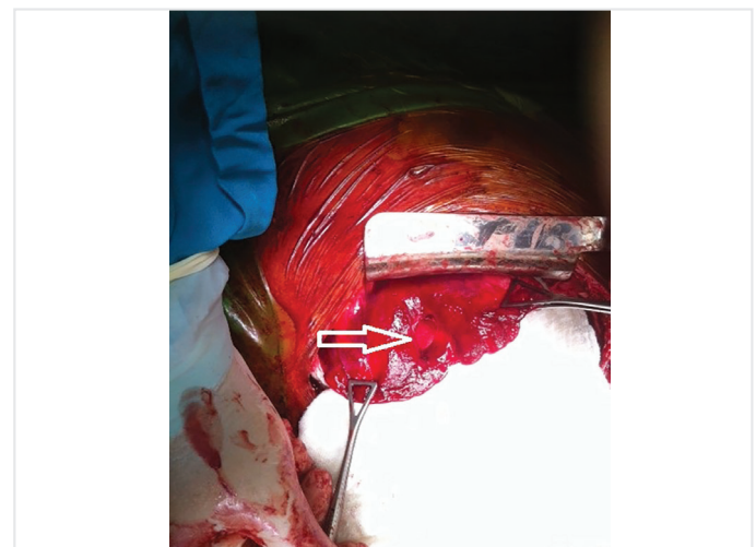
Figure 3. Tissue loss in the lingular segment of the upper lobe (white arrow)

Bullets with a velocity more than 609.6 m/s are called high-energy bullets, whereas those with a velocity less than 457.2 m/s are called low-energy bullets (6). From a ballistic aspect, BCs act as low-energy weapons, mostly in civilian use. The differential diagnosis between conventional ammunition and BC injury is very complex and almost impossible (2,4,5). This was the case in our report. Initially, we thought it was a